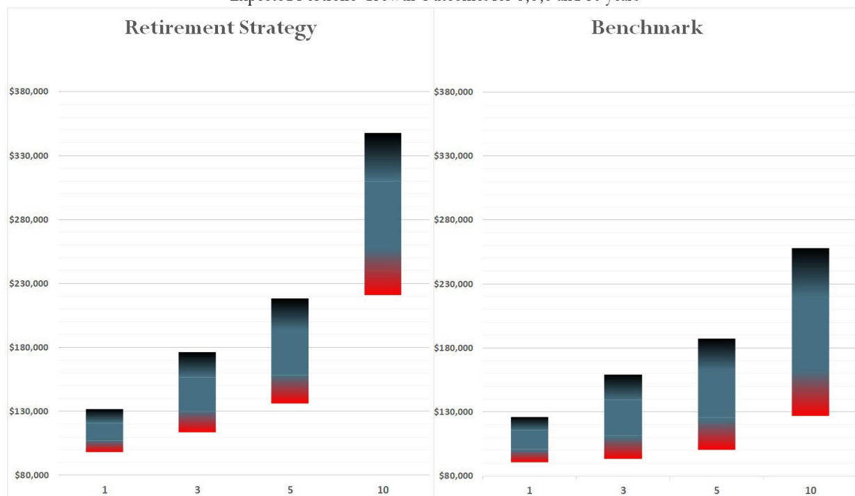
Expected Portfolio Growth Outcomes for 1, 3, 5 and 10 years

Above: Hypothetical Growth of one dollar (top half). Drawdown comparison over time (bottom half). Benchmark: Combination 60% SPDR SP500® ETF/40% iShares® US Aggregate Bond ETF (above and below).